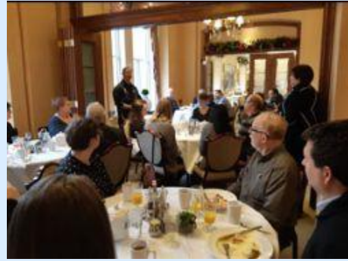
Holiday Breakfast 2018

Please be aware that a 15% gratuity will be applied automatically to your bill.