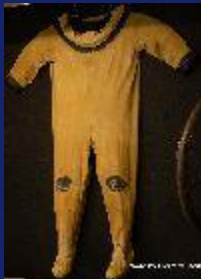
Diving suit, Manitoba Marine Museum (Selkirk)